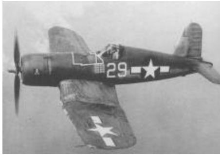
Black Sheep Squadron F4U-1, Corsair

28 pilots, a Flight Surgeon, and an Air Intelligence Officer. When asked by General Moore what name he had picked for the squadron Boyington said "Well, General, they come from all over so I'm gonna call them just what they are, bastards. Boyington's Bastards." A name that we kept until our combat totals started being noticed and a new name change was mandated by Marine Corps PR because the press would not be able to print such an offensive name for the people back home to read without being offended.